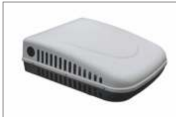
Vehicle Mounted Air Conditioning