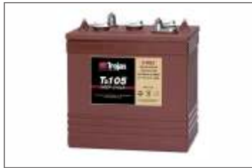
Trojan Battery (from USA)