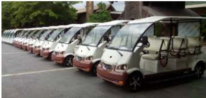
Scenic Spot of Hainan, China