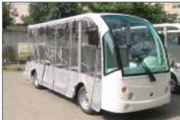
Weather Enclosure For DN-14