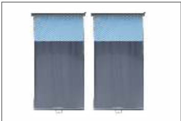
Side Sunshade Curtain For DN-11