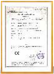
CE Certificate for Mobility Scooter