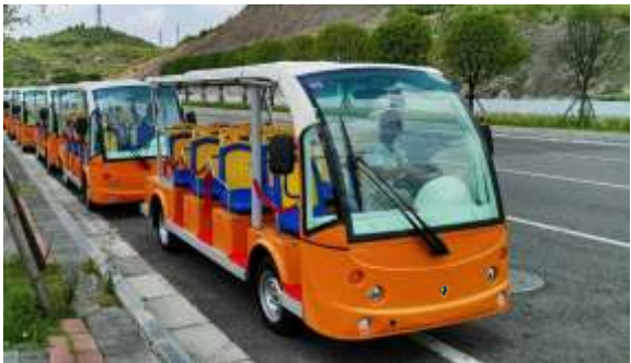
Scenic Spot of Hubei, China