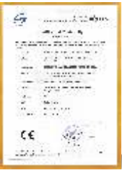
CE Certificate for Hunting Car & Utility Vehicle