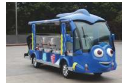
DN-14F Dolly Fish