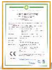
CE Certificate for Mobility Scooter