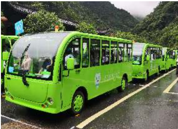
Scenic Spot of Jiangxi, China