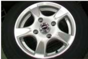
Aluminium Rim For DN-14