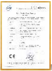
CE Certificate for Electric Scooter

Due to the advanced imported facilities and professional R&D teams with over 100 experienced engineers, Marshall is determined to build a responsible and reliable enterprise by offering top quality new products and best services to our customers in every corner of the world.