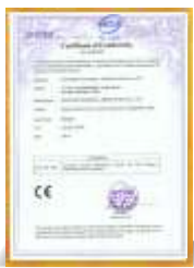
CE Certificate for Sightseeing Vehicle