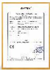
CE Certificate for Golf Car