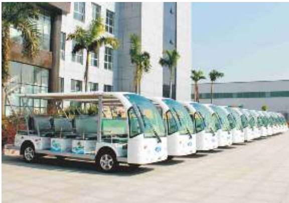
Hong Kong-Zhuhai-Macao Bridge Project