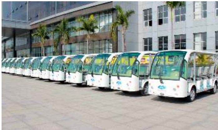
Scenic Spot of Huizhou, China