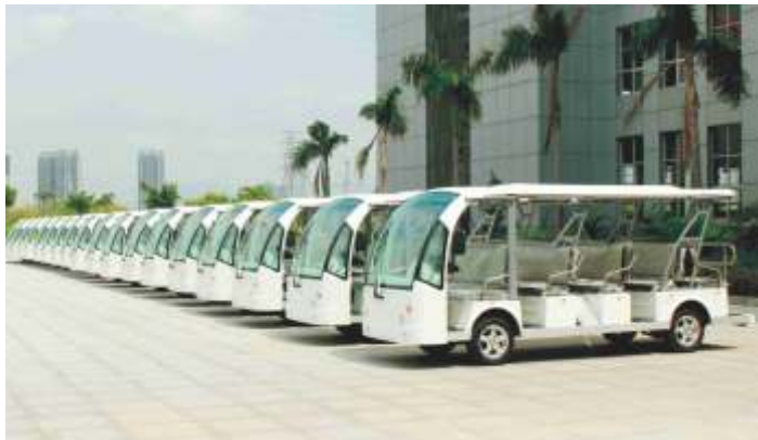
Military World Games