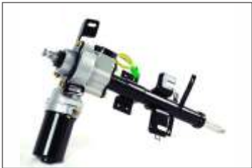
Power-assisted steering system